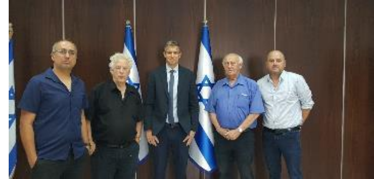
Meeting the Minister of telecommunication in Jerusalem with a delegation of the regional municipalities