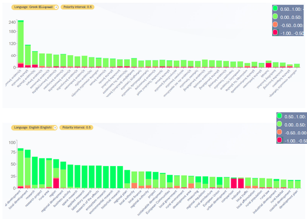
Figure 1. Polarity Scope of Topics a) in Greek language, b) in English language

With polarity set to “Topics” and two active filters (English and Greek language), the reading list provided the following results with the top topics being shown in the figure below.