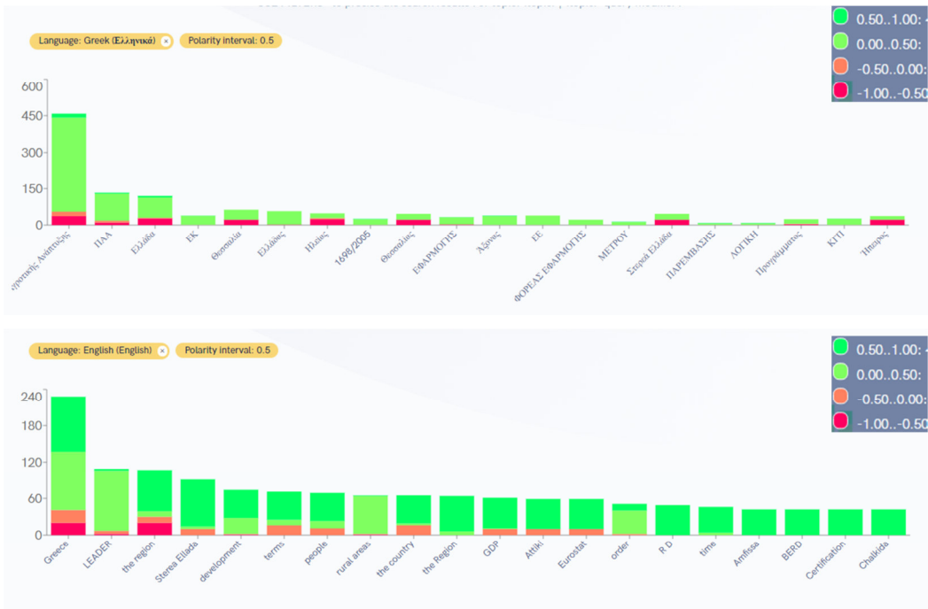
Figure 2. Polarity Scope of Topics a) in Greek language, b) in English language

With polarity set to “Keywords” and two active filters (English and Greek language), the reading list provided the following top Keywords. The keywords in the Greek language were referring mainly to regions, and so didn’t provide much insight. The top 2 keywords are rural development and Rural Development Program (RDP-ΠΑΑ). When looking at the English language, the LEADER keyword ranked second with positive polarity, while the sentiment is mainly positive for the majority of keywords.